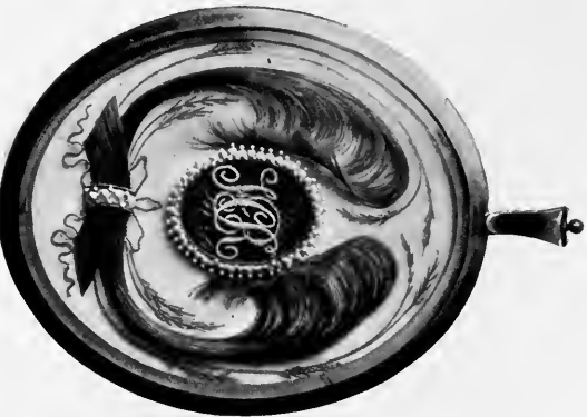
Reverse of Miniature